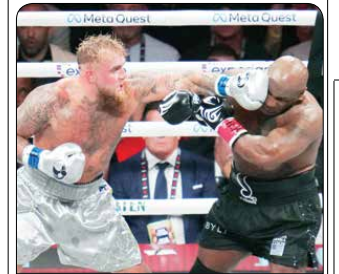
ARLINGTON (USA): Jake Paul won a unanimous decision over Mike Tyson as the hits didn't match the hype in a fight between the 27-year-old YouTube-turned-boxer and the former heavyweight champion in his first sanctioned pro fight in almost 20 years. All the hate from the pre-fight buildup was gone, replaced by boos from bewildered fans hoping for more action in a fight that drew plenty of questions about its legitimacy long before it happened. The fight wasn't close to the judge's door, with one giving Paul an 80-72 edge and the other two calling it 79-73.