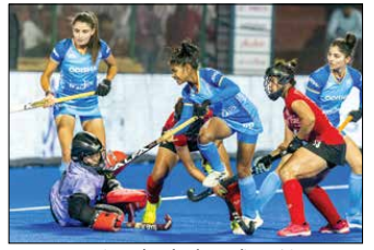
Beautyy Dung in a goalmouth melee as India won 3-0

boy, decides to join forces with three days of training, then it would be a different story. Mohammed Shami, who has bowled more than 43.2 overs, took seven wickets and scored 37 runs in the Ranji Trophy, is certainly going to join the team before the second Test. AGENCIES